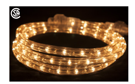
Premium Grade Incandescent Rope Light 2000K, 96CRI, 3.0W/ft, 4.6Lm per ft CSA rated for Canada

042-CL-2 2ft 042-CL-6 6ft 042-CL-10 10ft 042-CL-18 18ft 042-CL-30 30ft 042-CL-50 50ft