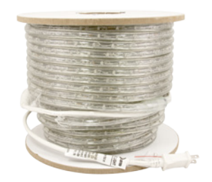
3/8" 120V INCANDESCENT 150FT REELS Non-rated, 18" series, 150ft max run

RL-CL-150 Clear, 5.5W/ft, 8Lm/ft RL-FR-150 Frosted, 5.5W/ft, 6Lm/ft RL-AM-150 Amber, 5.5W/ft RL-BL-150 Blue, 5.5W/ft RL-GR-150 Green, 5.5W/ft RL-PI-150 Pink, 5.5W/ft RL-PU-150 Purple, 5.5W/ft RL-RE-150 Red, 5.5W/ft RL-YE-150 Yellow, 5.5W/ft